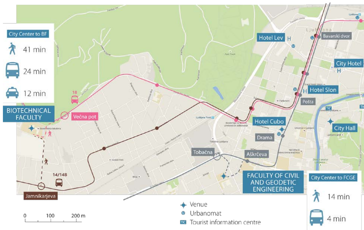
Accessibility of the venues with the public transport