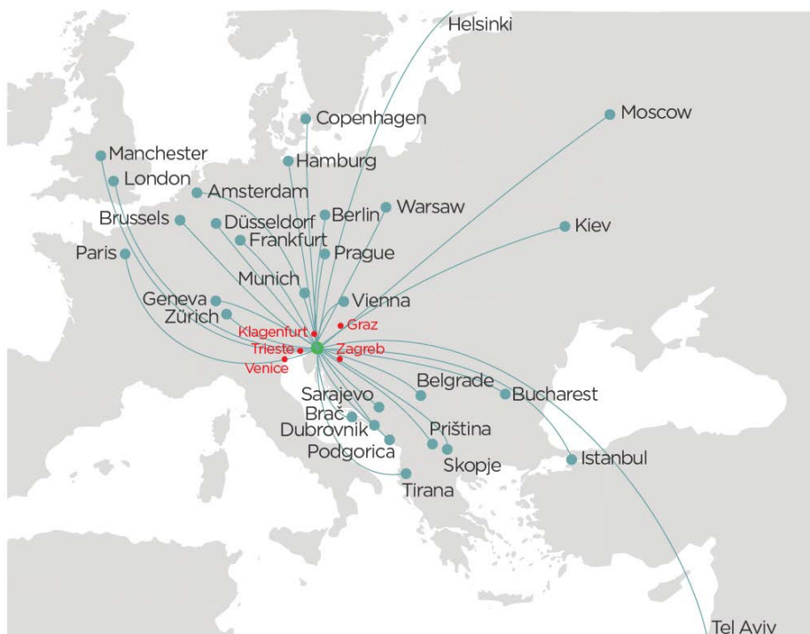
Network of scheduled flights from / to Ljubljana, March - October 2018. 270 direct scheduled flights to 31 destinations in 22 countries. The neighbouring airports providing additional flights alternatives are marked in red.