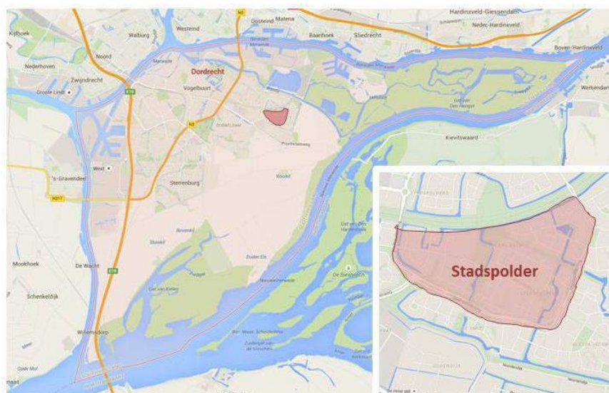
Figure 2 - Stadspolder's location in Dordrecht (in red)

Stadspolder in a neighbourhood in Dordrecht located in the east part of the city (see Figure 2). The neighbourhood was built in the 1980s and 1990s. Nowadays the public space is in need for reconstruction and therefore the municipality of Dordrecht seized this opportunity to not only renew the streets, sewage system, parking lots and green space, but to redesign the public space and making it more climate resilient. The Stadspolder neighbourhood has a so-called cauliflower structure, which was typically applied to Dutch neighbourhoods designed in the 1970s and 1980s. These cauliflower neighbourhoods are characterised by a maze-like grouping of cul-de-sacs or small courtyards intended to encourage social bonding by facilitating spontaneous encounters among neighbours (Wekker, 2016), to improve intimacy and to reduce through traffic. Main problems in the Stadspolder neighbourhood concern parking (limited parking space, parking in front gardens), dwellings with low doorsteps and accessibility.