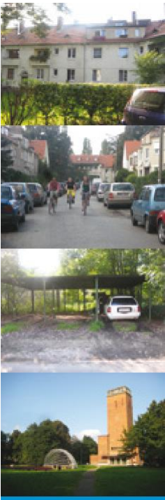
Existing urban fabric

> The garden city Sępolno was built between 1919 and 1935 with small housing for workers east of the Wrocław city centre around a central open space with public facilities and surrounded by allotments. It got gradually gentrified, sometimes with unauthorised modifications. Its labyrinthine street pattern in the shape of a Silesian Eagle is now cluttered with parked cars and lacks legibility. Despite its turbulent history, Wrocław managed to preserve its urban structure, together with many unique buildings, besides neglected and mismanaged areas. Sępolno's historic urban texture and social pattern give this neighbourhood its identity, but participative management could improve its sustainability and prepare it towards becoming European Capital of Culture in 2016.