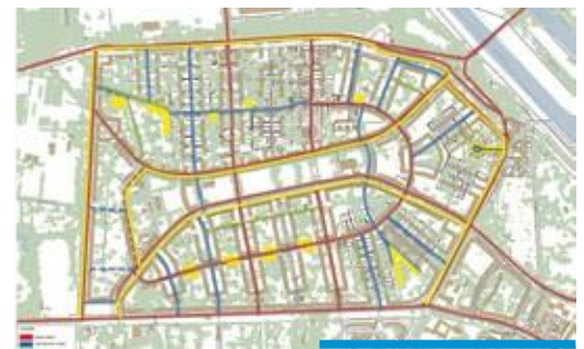
Street types and parking potential. Red - main streets, blue - secondary streets, green - pedestrian paths, yellow - parking places

Reconfiguring some of the streets will not only improve their technical condition, but will also improve legibility by highlighting the different characteristics of the main and secondary streets. Such reconfiguration will also alleviate the parking problem which Sępolno currently faces. New development will provide new housing solution and better parking conditions, due to a new street configuration. Finally, the creation of a social partnership involving residents and the local authorities will be a key component of allotment management, design and use of parking, and non-intrusive renewal interventions in the housing stock. If a balance between development and heritage, intention and use is maintained, we are fully confident that Sępolno will continue to be an enjoyable, pleasant, sustainable place for all its residents.