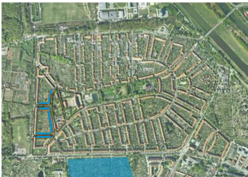
Development potential based on Google Maps