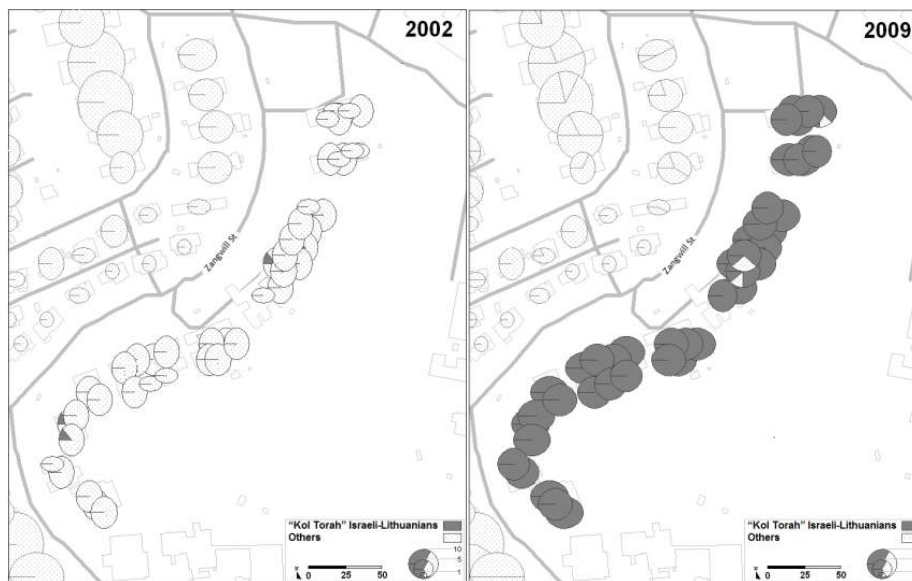
Figure 5a,b: Spatial intervention of Kol-Torah to Zangwill Street 2002 and 2008

The rapid movement patterns were well planned. The designated area was marked by the leaders of the community. In 2002, three Kol-Torah families purchased flats in different housing projects. By 2004 a few Kol-Torah families were living in Zangwill Street.