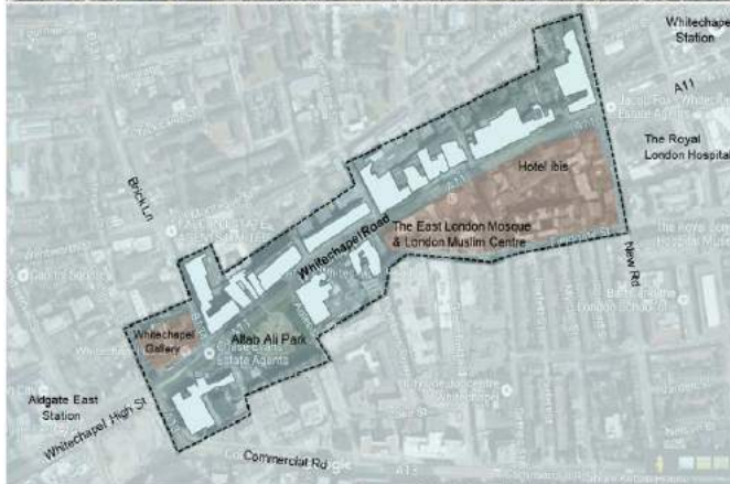
Figure 1: (a) Map of Central London with Whitechapel Road marked. (b) The research area of Whitechapel Road

Kiryat-Ha'Yovel is a Jewish neighbourhood in south-west Jerusalem (Figure 2a), populated by secular Jewish along with National-Religious and Haredi populations, including members of the Sephardic sects, the Chabad-Hassidic community, and Lithuanian sub-sects classified by national origin: Israeli, American, French and Sephardi-Lithuanian. In recent years, Israeli-Lithuanian Haredi of Kol-Torah have been purchasing flats on Zangwill Street, the north-eastern boundary of Kiryat-Ha'Yovel (Figure 2b).