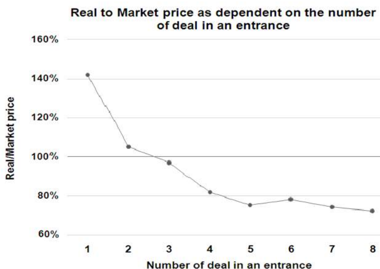
Figure 4: Average selling price to market price ratio as dependent on the sequential number of flats among those sold by the veteran Sylheti community.

Twenty-one interviewees explained the need to preserve the identification of the road with the Sylheti community as a reaction to the gentrification process: Saba (53), preoccupied with a possible loss of individual cultural identity and the uprootedness of a society that is more and more similar to a market in which nothing prevents the stronger from dominating the weaker: "I am worried about an oncoming blending of local culture, as other multinational chains follow Starbucks into the area and attempt to gentrify it with their bland corporate décor and homogenous facades. We must defend our area and culture from taking over". Puja (34) adds: "I see Shoreditch, about a mile from here, that every venue have the same hipster formula applied. There's no place for identity anymore". Abida (26) claims: "It feels that the East-End becomes a playground for the rich and Japanese. We are worried that property prices soar pushing us, the original residents, out. We'd better sell inside.". As of 2002, indirect collaborations had succeeded in strengthening the Sylheti presence on Whitechapel Road. Collective behaviour thus attracted Sylheti newcomers. The area designated as Sylheti territory was marked by its own market prices, increasing the community members' sense of place, and improving their ability to cope with local challenges.