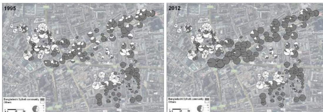
Figure 3a-b: Spatial intervention of Sylheti community to Whitechapel Road 1995 and 2012

Although a Bangladeshi Sylheti community has lived in the Whitechapel neighbourhood for decades, only the recent experience of gentrification and 21st-century migration - first from Ireland, Greece and Austria, and since May 2004 also from Eastern Europe - followed by significant socio-economic change and physical renewal, motivated a collective behaviour process along Whitechapel Road. Examining the occupation process of Whitechapel Road by Bangladeshi Sylheti people between 1995 and 2012 (Figure 3a-b) can indicate the abilities and limitations of a non-organised community in the creation of a defined enclave within a free market.